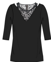
Ref. 40563 Lace Panel T-shirt Rail sample : S Price : £45/€52 ■ 900 black