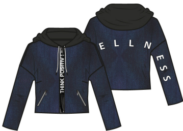
Ref. 40566 Printed Back Hoodie Rail sample : S Price : £67/€77 ■ 620 navy