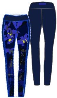
Ref. 40570 Printed Leggings Rail sample : M Price : £49/€57 ■ 620 navy