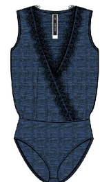
Ref. 40565 V-neck Lace Body Rail sample : M Price : £45/€52 ■ 617 midnight blue