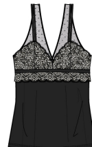
Ref. 40564 Plumetis and Lace Top Rail sample : S Price : £40/€46 ■ 900 black