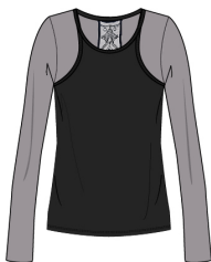
Ref. 40562 Long Sleeved Embroidered T-Shirt Rail sample : M Price : £45/€52 ■ 900 black