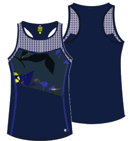
Ref. 40569 Printed Top with Mesh Rail sample : M Price : £39/€45 ■ 620 navy