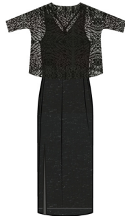
Ref. 40571 Jersey Dress with Devore Top Rail sample : M Price : £65/€75 ■ 900 black