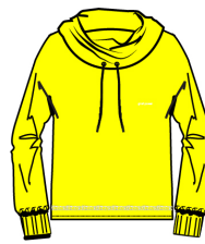
Ref. 40568 Hooded Sweatshirt Rail sample : M Price : £49/€57 ■ 107 lemon